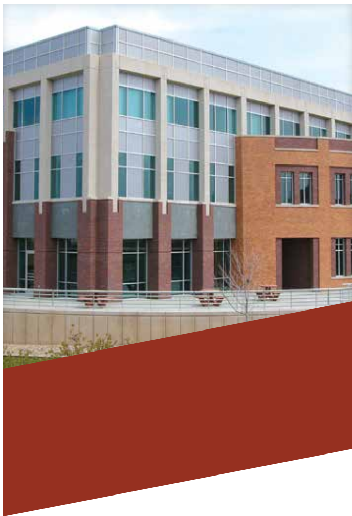
Ritchie Bros. Auctioneers in Lincoln, Nebraska